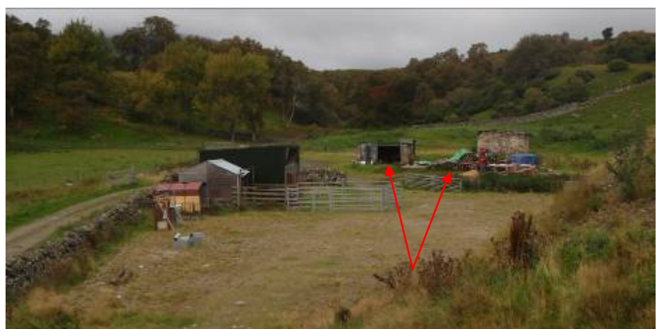
Fig. 6 : Former buildings on the site (2010)

33. <u>Kingussie Community Council</u>: No response has been received from the Community Council at the time of writing this report. However, a response was received in the course of the previous application for planning permission in principle. At that time the Community Council raised no objection to the proposal and recognised the need for a house on the subject site due to the applicant being engaged in working the croft.