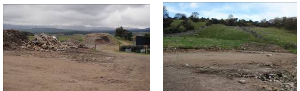
Figs 2 and 3: proposed site as currently existing

3. The current planning application is the 'follow up' application, seeking approval of matters specified in the original conditions, chief of which is the house design and detailed site layout. The proposed dwelling is a U shaped form, with reference made in supporting documentation to the intention that it would reflect a steading. A number of design amendments have been made in the course of this current application, in order to better achieve an appropriate design expression of the steading concept. Other than the U form, the original design was more reflective of a generic bungalow, being somewhat suburban in appearance, and not designed to take account of the rural location and unique features of the subject site or its visibility from